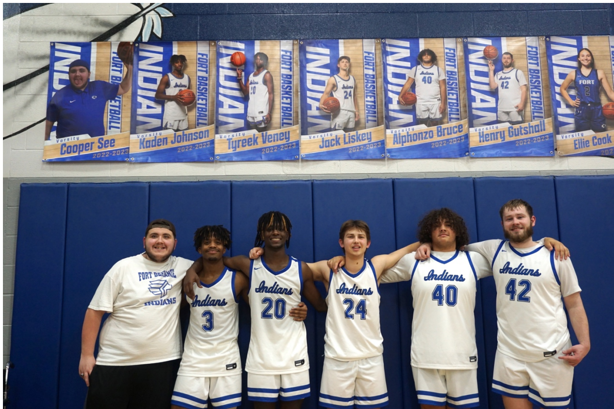
Seniors pose under their posters displayed on the wall of the Don Landes Gym at FDHS