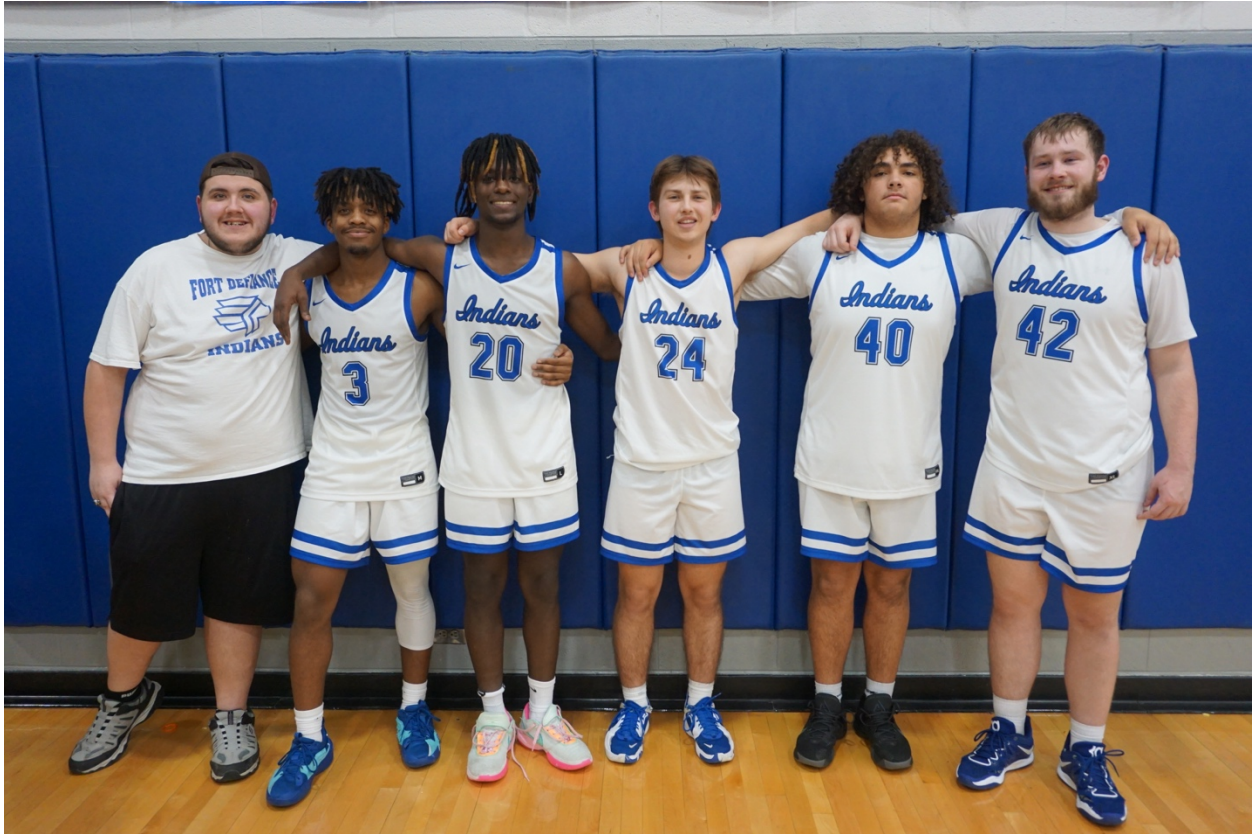
FDHS Seniors wearing the Blue and White for the last time in the Don Landes Gym