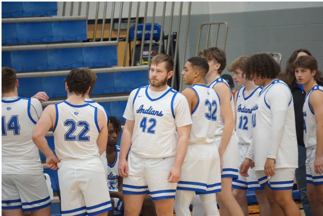
FDHS Prepares to take on Bison