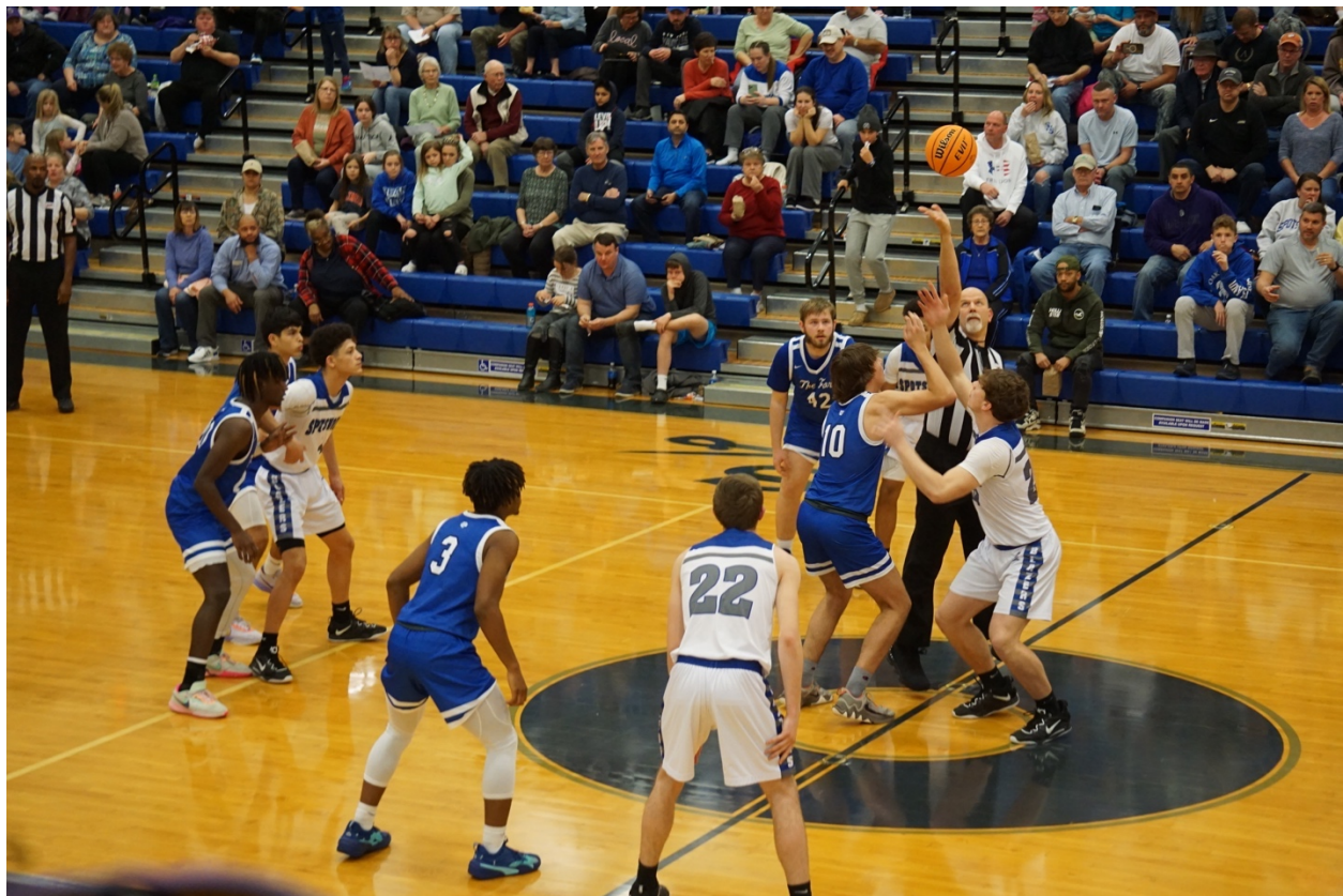
Indians tip off against the Trailblazers in the Region 3C Quarterfinals