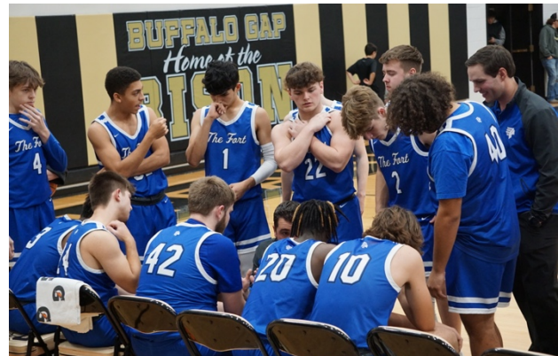
Indians Prepare to Corral Bison