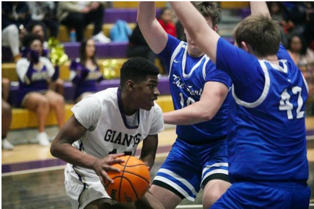
Indians Scalp Little Giants at Waynesboro