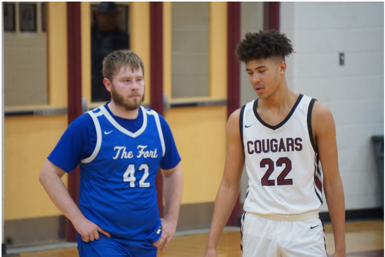
Indians rally in second half to defeat Stuarts Draft in final regular season game