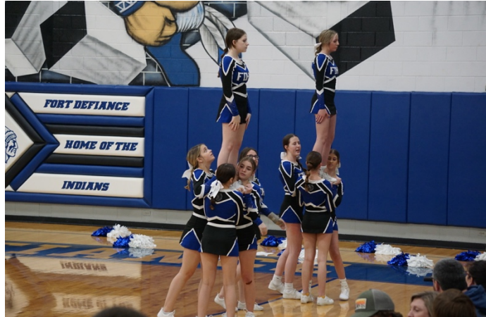
Fort Cheerleaders Urge Indians to Victory

FDHS is back in action at home next week with back-to-back games against Buffalo Gap and Monticello.