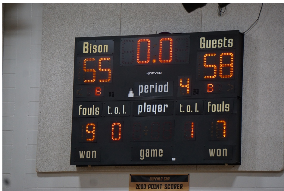
Indians Take Down Bison in Crucial Shenandoah District Game