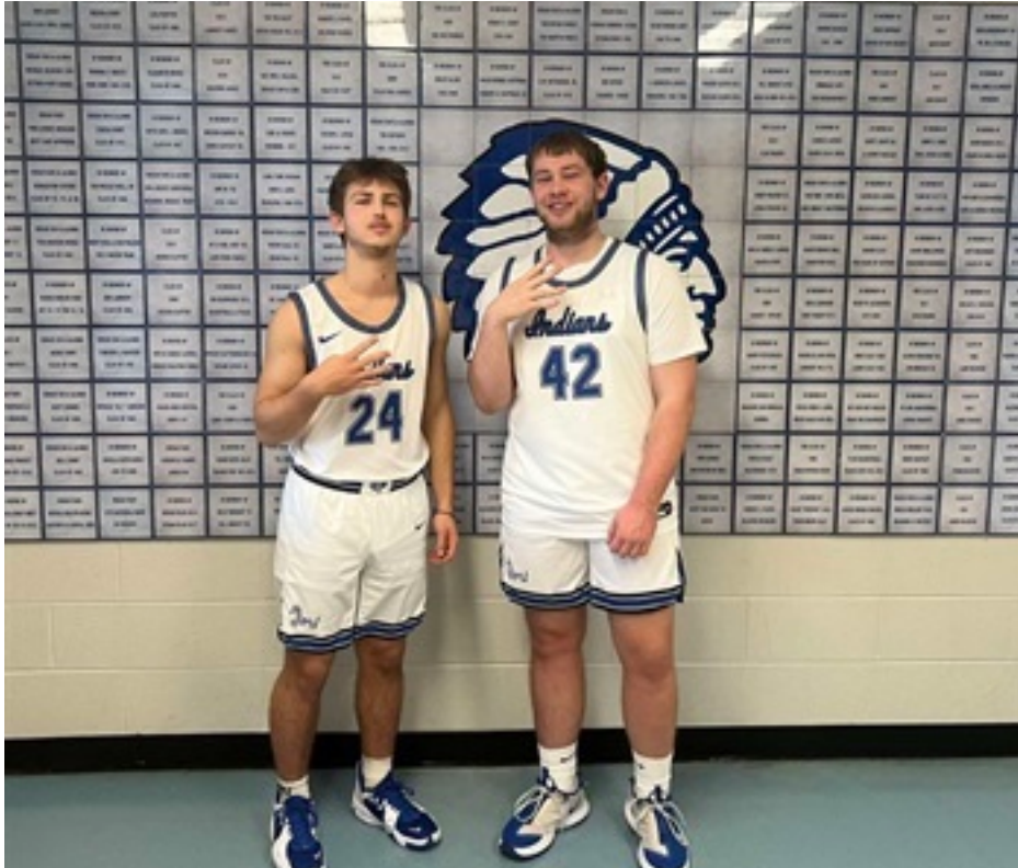
Good Friends On and Off the Court

TURNER ASHBY (41) — Baylor 6 2-3 14, Shank 2 0-0 4, Bailey 4 1-2 11, Fox 2 0-0 5, Smith 1 0-0 3, Lyons 1 0-0 3, Seifert, Moseley, Bravo, Bass, Spotts, Shifflett TOTALS 16 3-5 41.