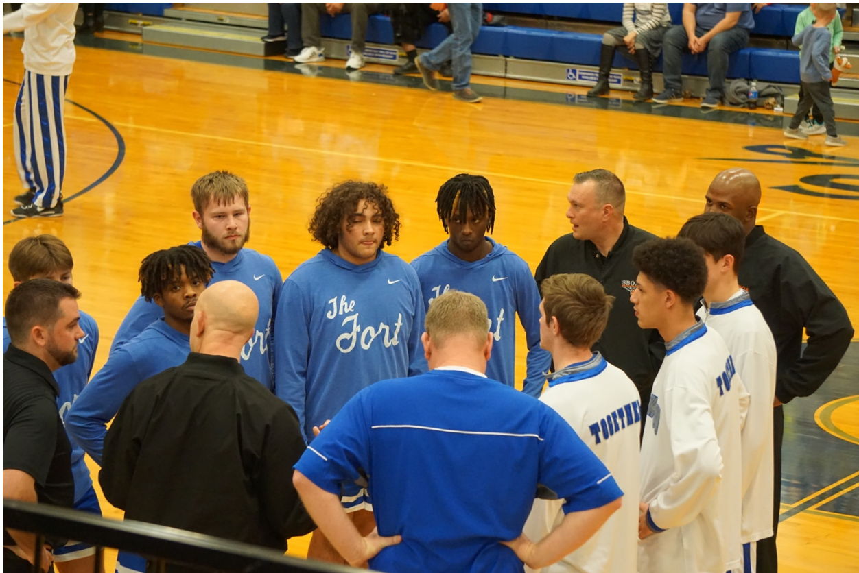
Senior team captains at their last game